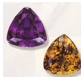
Amethyst and citrine

Be careful then, when on Halloween, you see a witch with a bag full of stones. You have been warned! (not seriously)