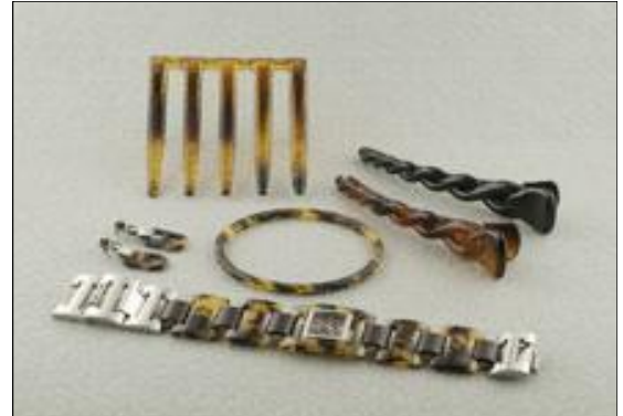
Tortoise shell jewellery.

The Hawksbill turtle is an endangered species and supplies of tortoiseshell are limited. Brazil, West Indies, Indian and Pacific oceans are the main sources.