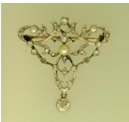
Delicate Georgian Pendant

Today's record price of gold and platinum means that those bulky, weighty pieces of the past, which are collecting dust or waiting for burglars, are now worth a fortune. The stones they contain can be reset into a lighter weight, fashionable, wearable, specially designed piece of jewellery - which need not cost a fortune as the excess gold could be traded in to pay for the manufacturing cost. Raid your wardrobe – remodel your gold and wear it again, as it should be.