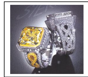
Modern micro set rings with fancy colour diamond