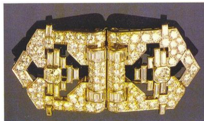
Art deco clip Brooch