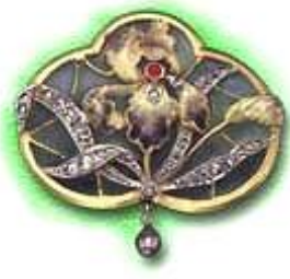
Art Nouveau Brooch